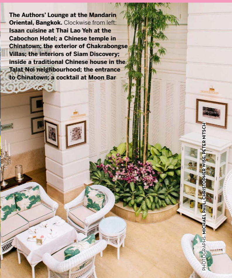
The Authors' Lounge at the Mandarin Oriental, Bangkok. Clockwise from left: Isaan cuisine at Thai Lao Yeh at the Cabochon Hotel; a Chinese temple in Chinatown; the exterior of Chakrabongse Villas; the interiors of Siam Discovery; inside a traditional Chinese house in the Talat Noi neighbourhood; the entrance to Chinatown; a cocktail at Moon Bar