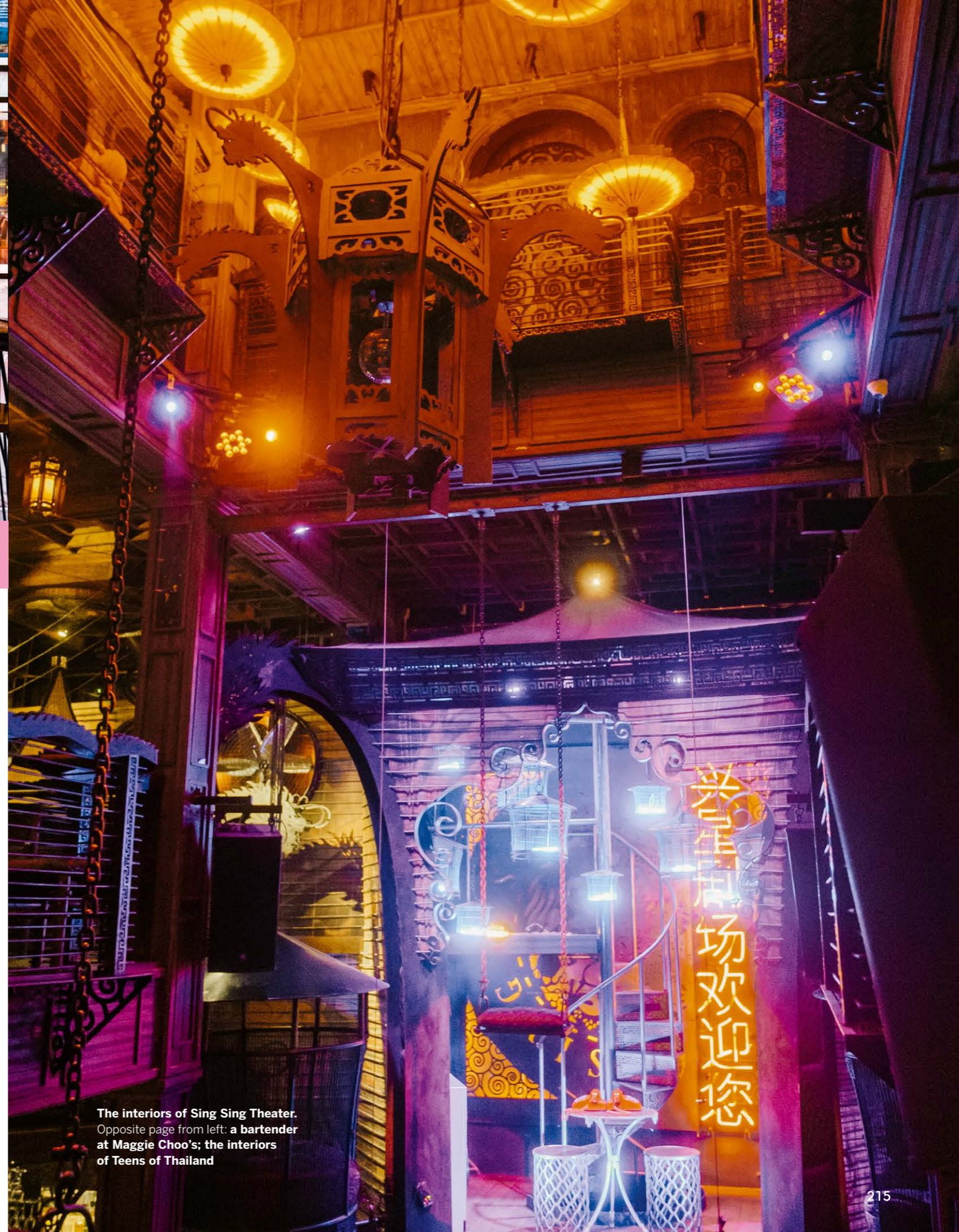
The interiors of Sing Sing Theater. Opposite page from left: a bartender at Maggie Choo's; the interiors of Teens of Thailand